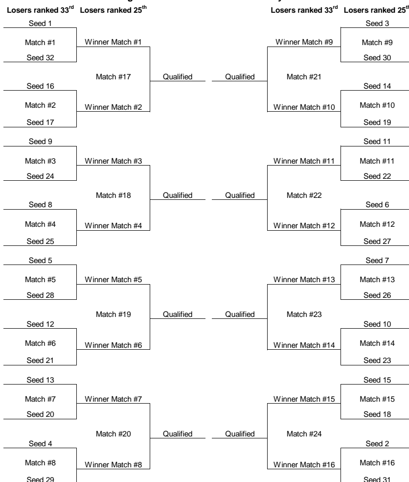
Challenge: 32-Team Qualification to Qualify 8 Teams