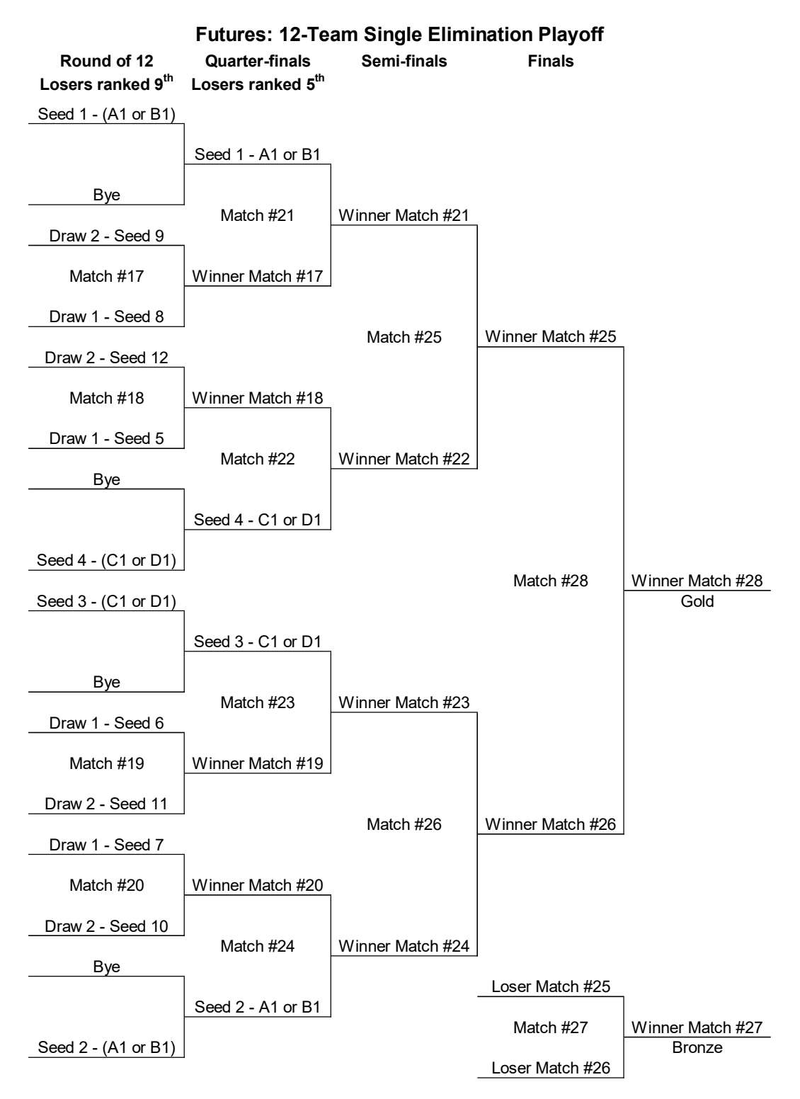
Page 7 of 11

If a team is disqualified after the pool play (after the Drawing of Lots for single elimination phase) of the tournament due to a positive doping test, it will lose the last pool matches played by forfeit (see above). If the single elimination phase has already started and if they have not played yet they forfeit their match, and the opponent will be then moved to the next round. The final pool ranking will be maintained. If the team already played its match and won the match, the match result will not be changed, and this team will forfeit the next round. However, if a team is disqualified from the tournament due to a positive doping test after the conclusion of the drawing of lots (for the seeding of the single elimination phase) but before the commencement of the first match of the single elimination phase, they will be replaced in the draw directly by the next eligible team(s) eliminated from the tournament to be decided by FIVB/organizer. And the final pool ranking will be maintained. The disqualified team will receive no final ranking. It should be shown on the bottom of the final standing without rank and "DSQ."