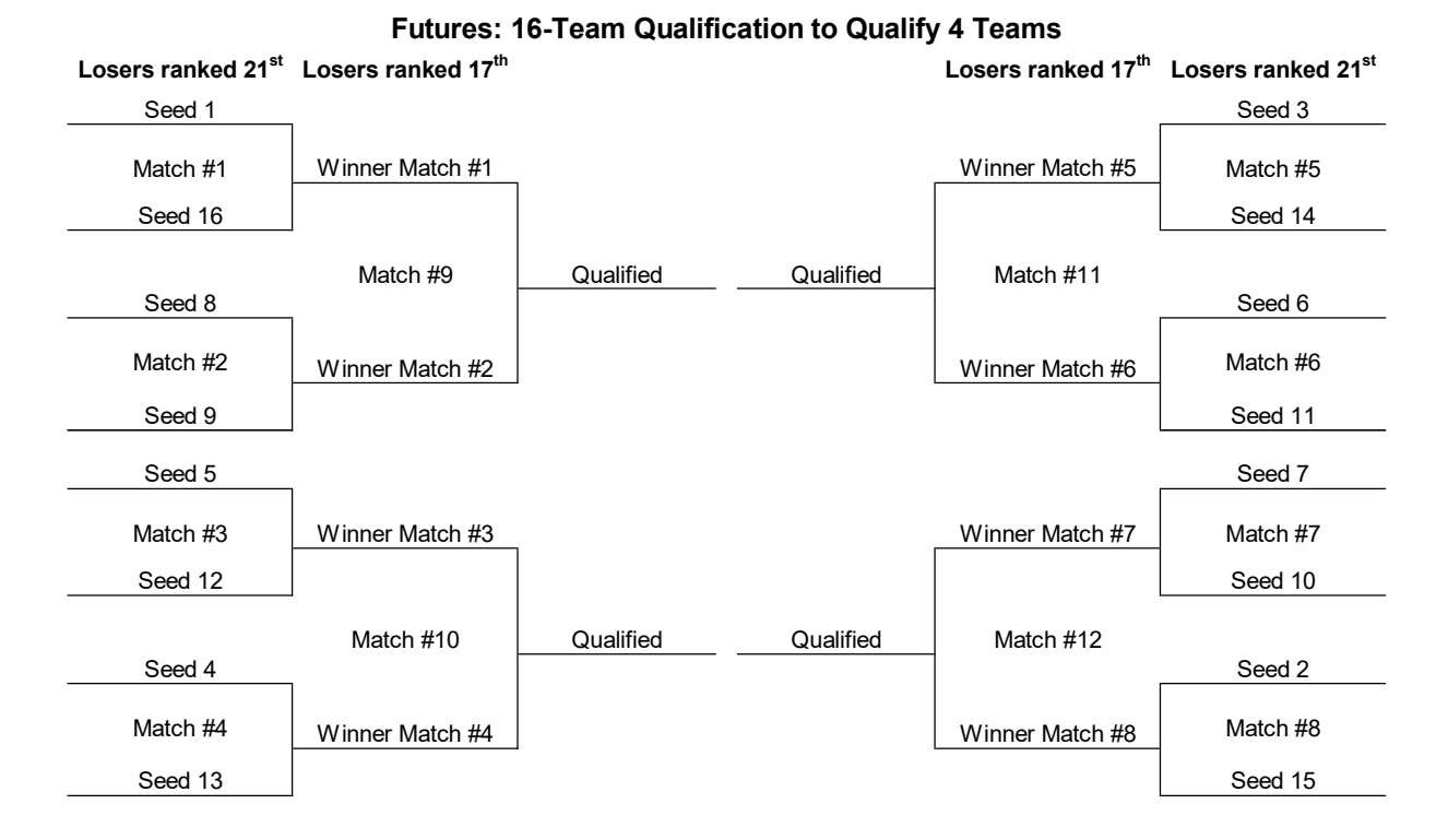
Page 4 of 11